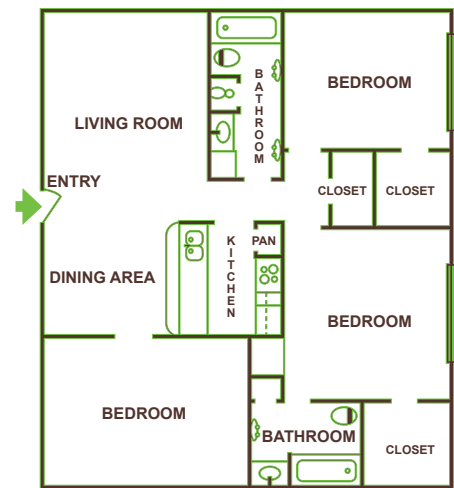
3 2 1212 Sq. Feet Rent: $ _____ Deposit: $ _____