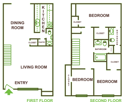
3 Bed 2.5 Bath 1411 Sq. Feet Rent: $ _____ Deposit: $ _____