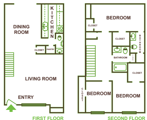
3 2.5 1411 Sq. Feet Rent: $ _____ Deposit: $ _____